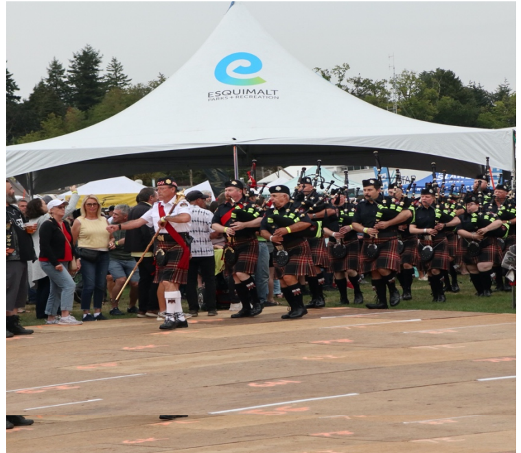
Surrey Fire Fighters' Pipes & Drum Corp

During the judging, the Surrey Fire Fighters' Pipes and Drum Corp performed on the dance floor to the delight of the crowd.