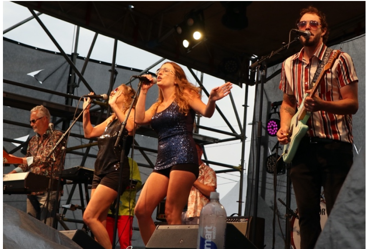
Tight Hair Disco gets the crowd rocking.

Each day, local bands performed along with a headline group each night, comprising a total of 20 musical groups over the three days.