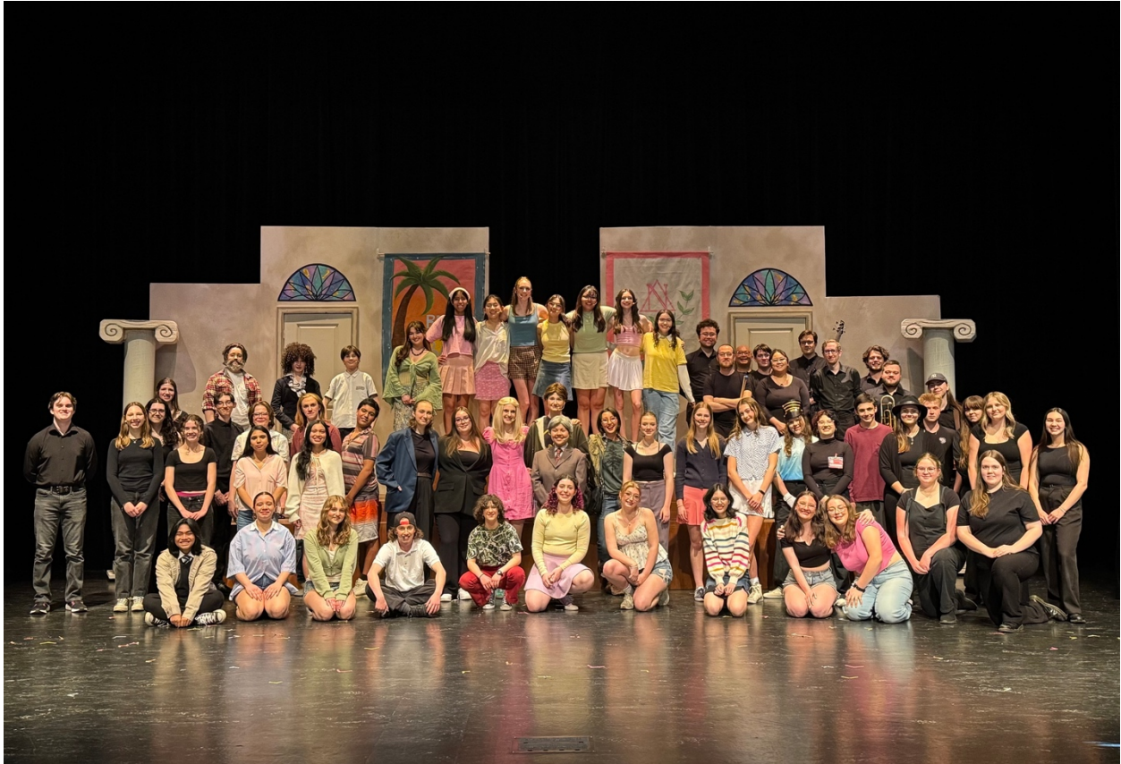
The Cast and Crew

Esquimalt High School Musical Theatre students took to the stage this spring to present their version of Legally Blonde: The Musical , a story about Elle, a sorority sister who follows her boyfriend to Harvard law school. Although she has marriage on her mind, Elle ends up realizing that when she is true to herself, and believes in herself, a new world of possibilities opens up to her. Such a great message for young people.