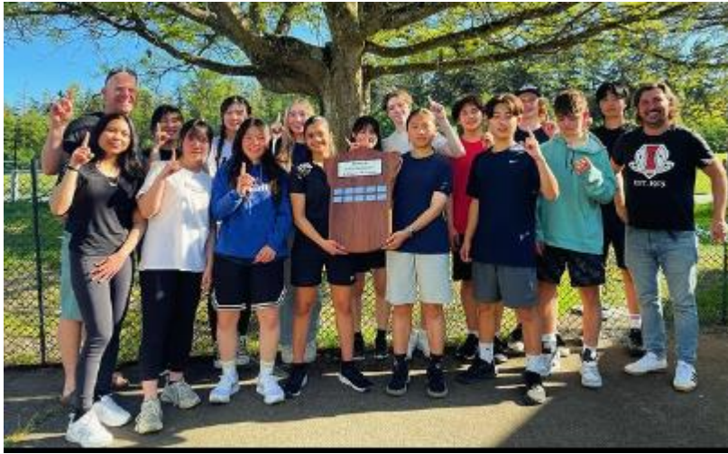
Congratulations to the Esquimalt Badminton team for going undefeated this season and winning the B league championships!!