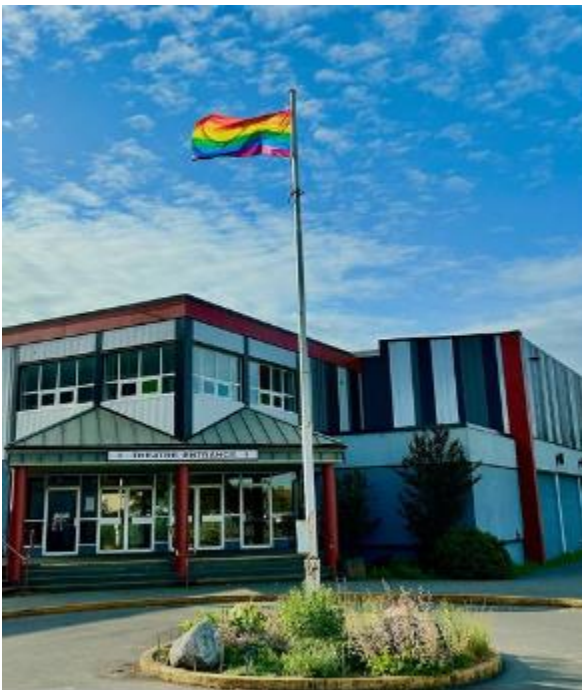
In support of Rainbow Week, we will be flying the Rainbow Flag until Tuesday, May 21st. Rainbow Week encompasses International Day Against Homophobia, Biphobia and Transphobia which is on May 17th. Our district and our school supports All Human Rights, including those of our children and staff who identify as 2SLGBTQIA+ Community. 🏳️‍🌈