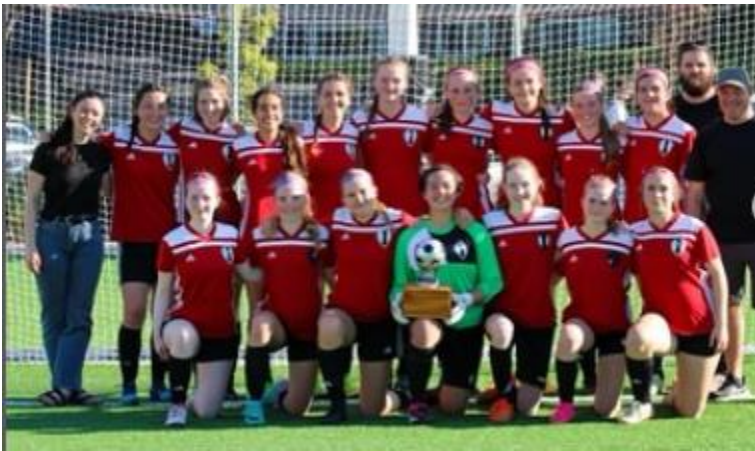
Congratulations to our Esquimalt Girls soccer Team for winning the Ryan Shield Final!! It's a great day for ESQ teams!