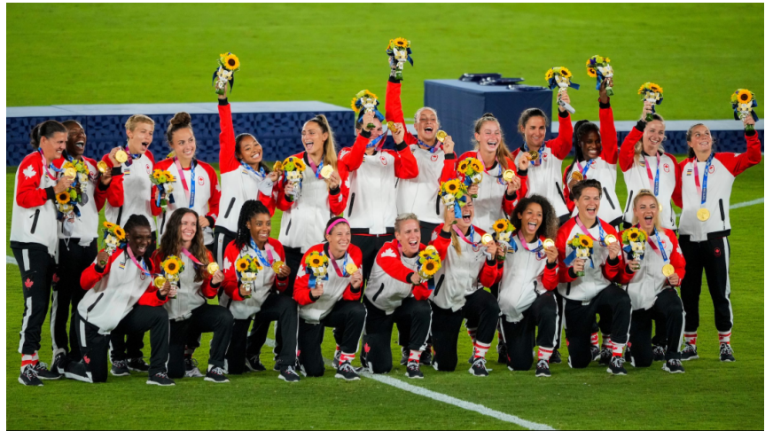
CANADA WINNING GOLD AT THE TOKYO OLYMPICS

The USA women's national soccer team (who have undergone their own fights for equality in the sport) showed their support during their game against Canada. At the start of the game, both teams wrapped their hands around each other and stood in solidarity for gender equality.