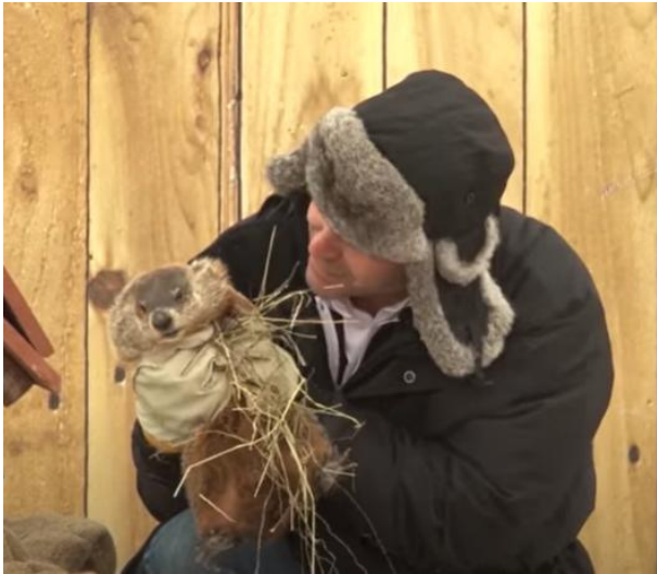
Fred la Marmotte in 2018

Despite the tragic loss of Fred la Marmotte in Quebec, other provinces in Canada were able to get help from their own groundhogs.