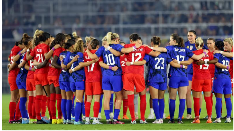
CANADA AND USA HOLDING HANDS

The team played in the SheBelieves Cup, but did it under protest. During their first practice back to protest, they wore their Soccer Canada shirts backwards and didn't show any Soccer Canada symbols.