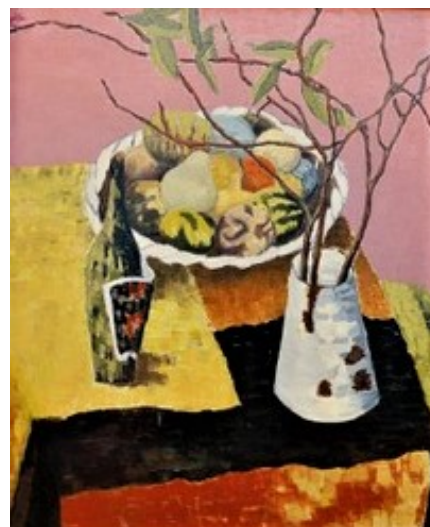
1964; Still Life with Enamel Jug and Fruit: Oil; (30" by 36")