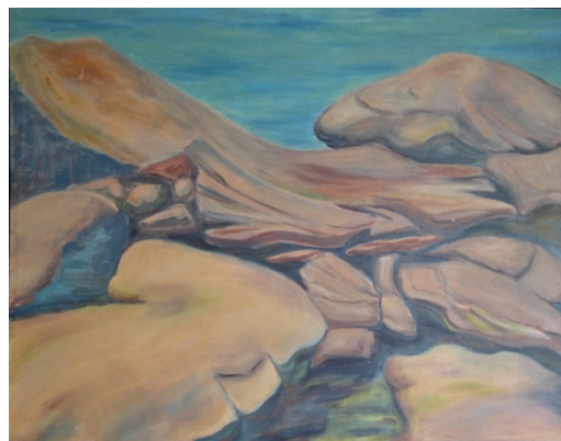
1966; Sandstone: Oil; (27" by 34")