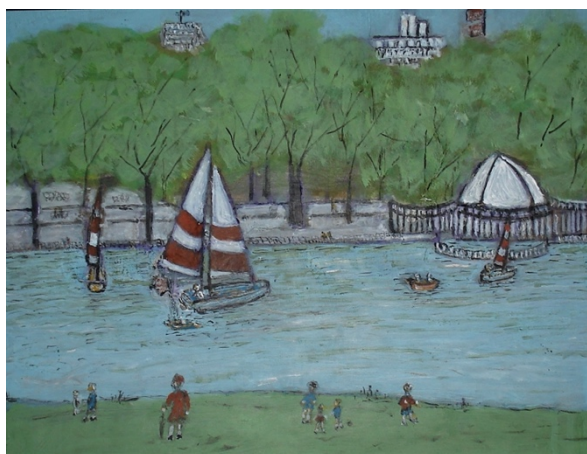
1995; Hyde Park, London: Oil on Wood from 1969 sketch; (16" by 12.5")