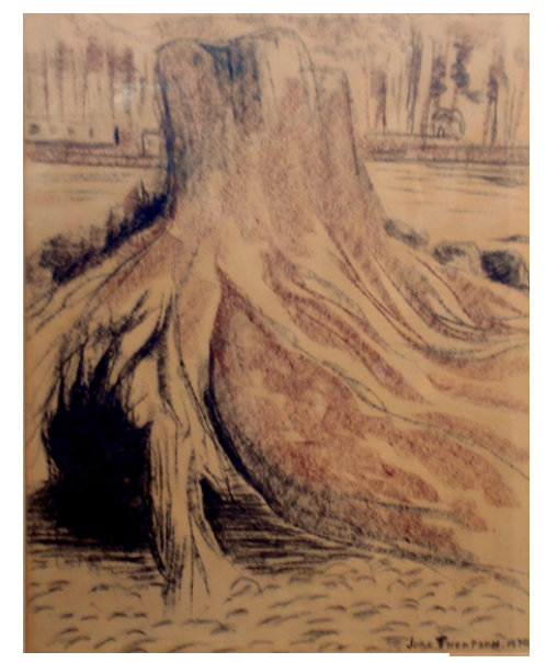
1970 Beach Visit to Patricia Bay; acrylic; 13" x 28"

some of her work we are including the following information contained in some biographical information from her daughter, Flora.