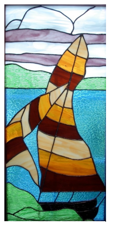
1985 Stained glass from Joan's Design (not for sale)