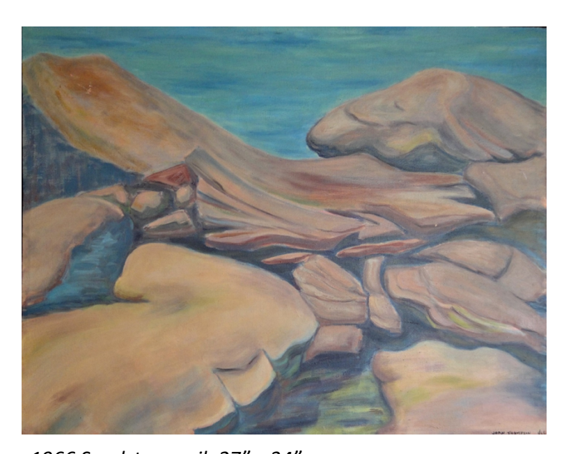
1966 Sandstone; oil; 27" x 34"